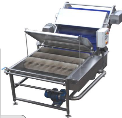
BRUSH WASHER- THREE LOWER BRUSHES